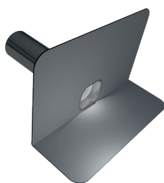
FO-PARAPET-PVC LT GREY